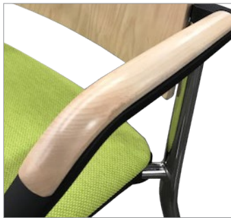
WOOD ARM CAP DETAIL