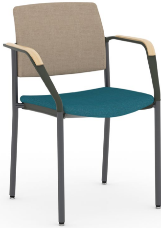
ARM CHAIR WITH TWO FABRICS, WOOD ARM CAPS AND BLACK POWDER COAT FRAME FINISH