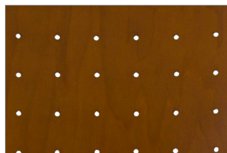
PERFORATED HOLES CUTOUT