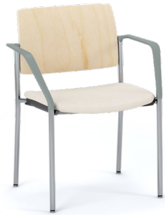
ARM CHAIR SHOWN WITH WOOD BACK AND UPHOLSTERED SEAT

Bruno chairs and stools are comfortable, versatile and stackable. Bruno comes standard with upholstered back and seat or upholstered seat and wood back. It also comes in five stylish colors and a polished chrome frame.