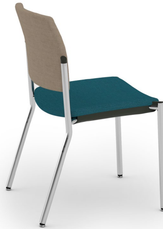
WALL SAVER FRAME (CHAIR ONLY)