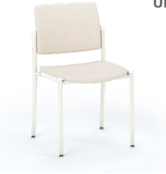
4 LEG CHAIR