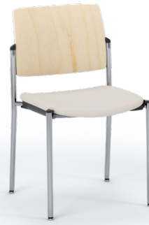
4 LEG CHAIR