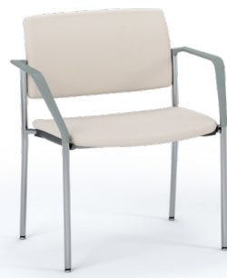
ARM CHAIR SHOWN WITH UPHOLSTERED BACK AND SEAT