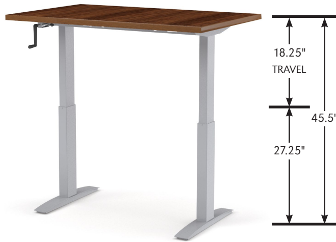
TRAINING TABLE WITH OPTIONAL HAND CRANK HEIGHT ADJUSTMENT