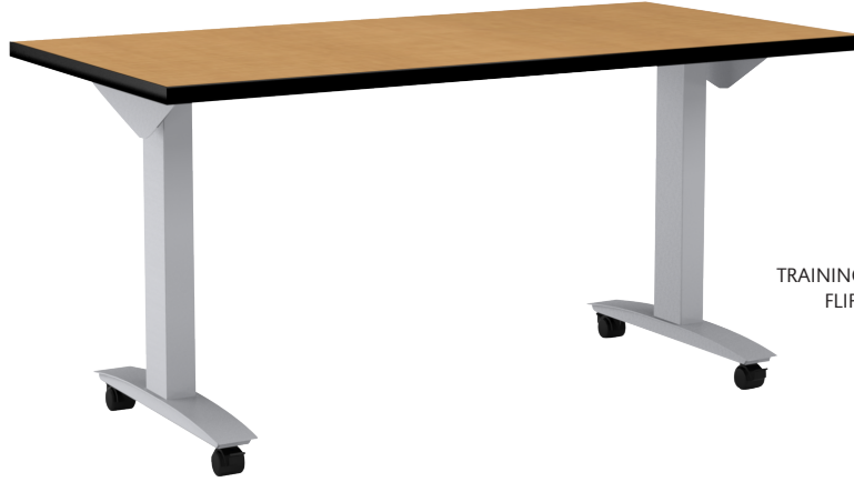
TRAINING TABLE WITH OPTIONAL FLIP-TOP AND CASTERS

Abby offers a great option in Cafe and Training tables. With available adjustable height and modern design, Abby makes a perfect addition to any public space.