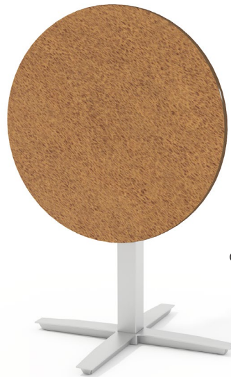
CAFE TABLE WITH OPTIONAL FLIP-TOP