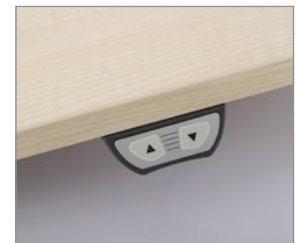
ELECTRIC UP / DOWN CONTROL DETAIL