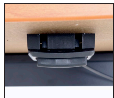
PNEUMATIC HEIGHT ADJUSTMENT LEVER DETAIL