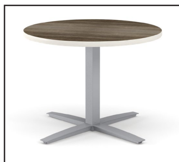
CAFE TABLE WITH OPTIONAL PNEUMATIC HEIGHT ADJUSTMENT