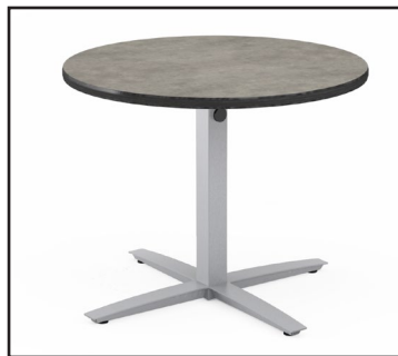
CAFE TABLE WITH OPTIONAL PIN HEIGHT ADJUSTMENT