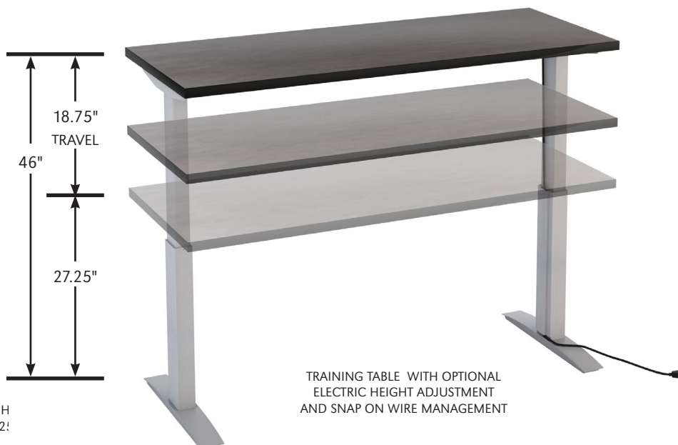
NOTE: H 1.25"