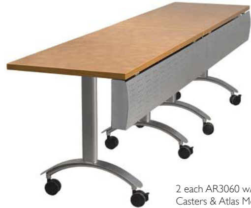
2 each AR3060 w/Ganging, Casters & Atlas Modesty Panels

ERG designs our products so that they can be easily disassembled and separated for recycling or reuse at the end of a products useful life.