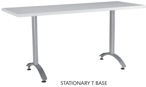
STATIONARY T BASE