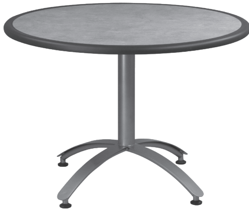
ROUND CAFÉ TABLE