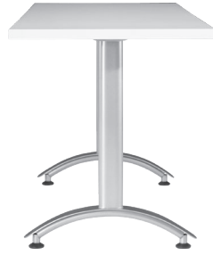
ARCCOS T-LEG PROFILE