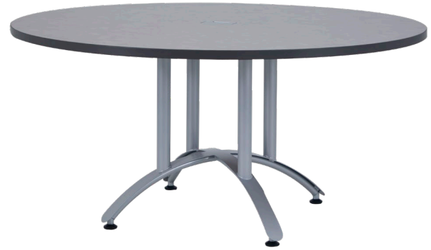
4 COLUMN CAFÉ TABLE