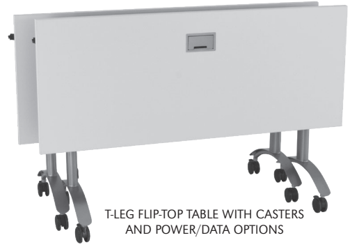
T-LEG FLIP-TOP TABLE WITH CASTERS AND POWER/DATA OPTIONS