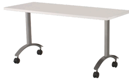
SHOWN WITH CASTERS