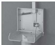
X-BASE FLIP-TOP DETAIL

Table top core is CARB Phase I & Phase II Compliant. Laminate, wood veneer and phenolic backing are glued with water based adhesives.