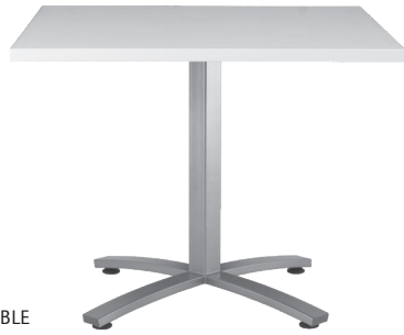
X-BASE CAFÉ TABLE