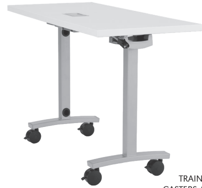
TRAINING TABLE WITH CASTERS AND POWER OPTION