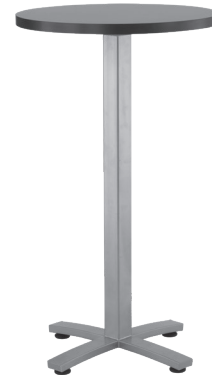
X-BASE BAR HEIGHT TABLE