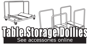
Table Storage Dollies See accessories online