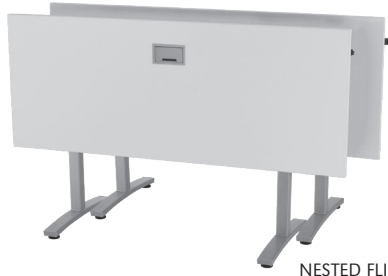
NESTED FLIP-TOP TABLES