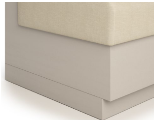
STANDARD BANQUETTE COMES WITH A FLUSH PLINTH BASE ON SIDES FOR GANGING, AND RECESSED FRONT.