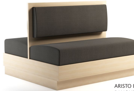
ARISTO BACK TO BACK BANQUETTE