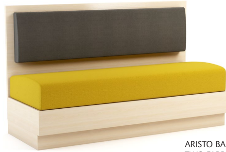
ARISTO BANQUETTE WITH TWO FABRIC OPTION AND RECESSED FRONT

The Aristo Series features a laminate frame and back. Seats and backs can be upholstered with your choice of fabric over high density foam.