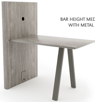
BAR HEIGHT MEDIA TABLE WITH METAL LEGS