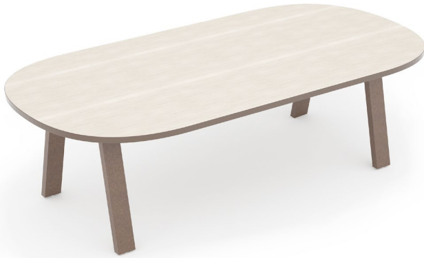
OPTIONAL RACETRACK TOP WITH WOOD LEGS