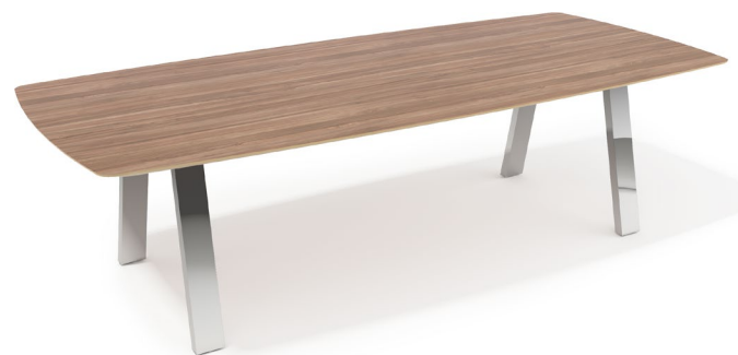
OPTIONAL ALMOST RECTANGLE TOP WITH CHROME LEGS