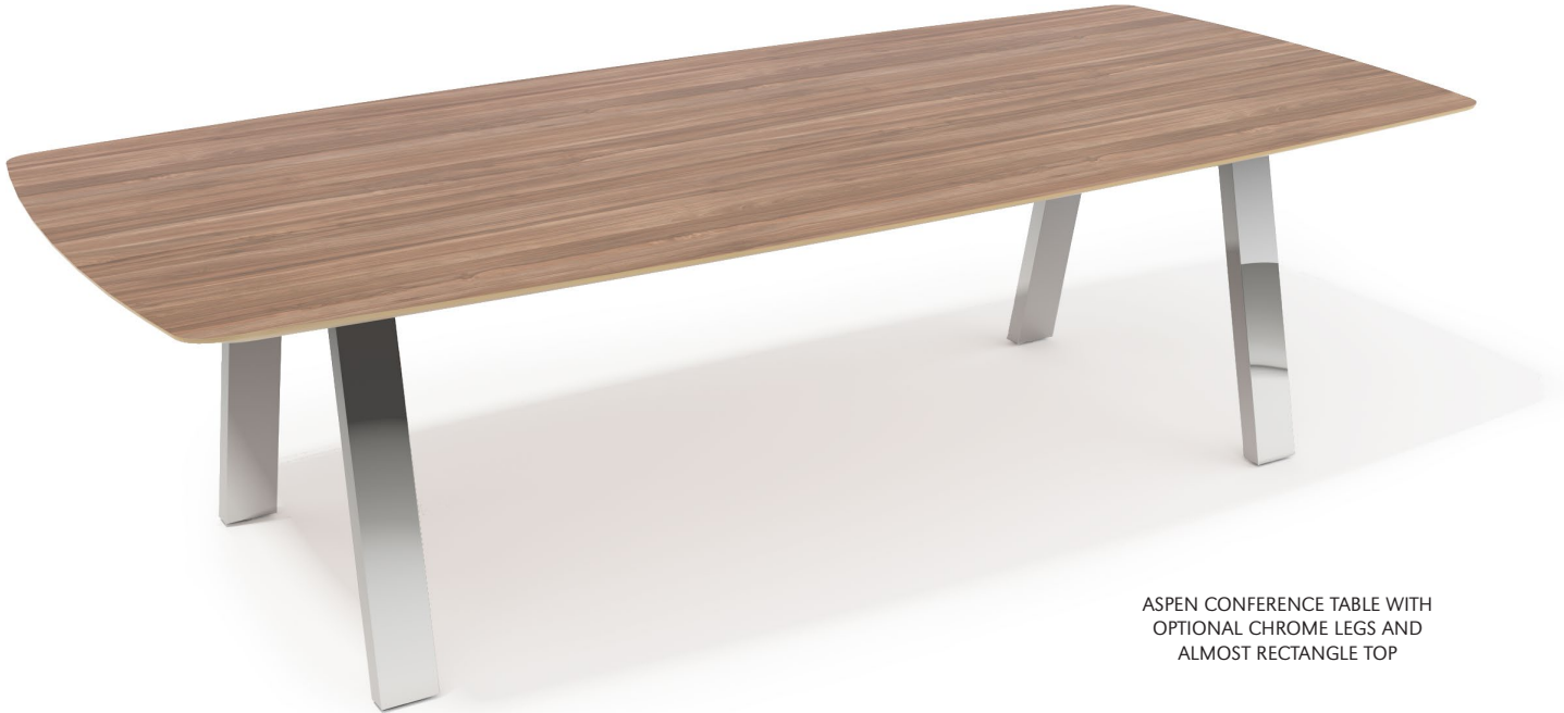
ASPEN CONFERENCE TABLE WITH OPTIONAL CHROME LEGS AND ALMOST RECTANGLE TOP

Aspen tables offer a dynamic style for conferencing and meeting areas. The angled metal or wood legs convey a bold and stylish look with a solid foundation.