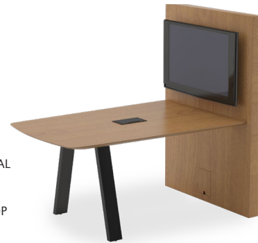
MEDIA TABLE WITH METAL LEGS AND OPTIONAL POWER/DATA AND ALMOST RECTANGLE TOP