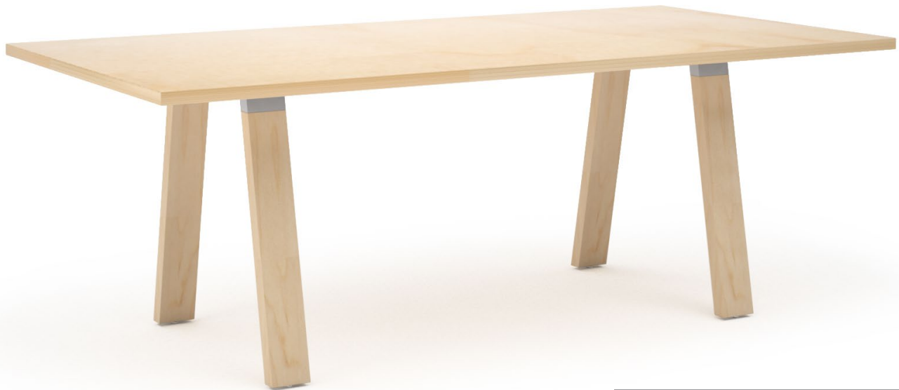
ASPEN CONFERENCE TABLE WITH WOOD LEGS