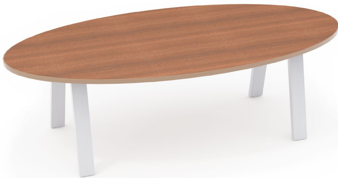
OPTIONAL OVAL TOP WITH METAL LEGS