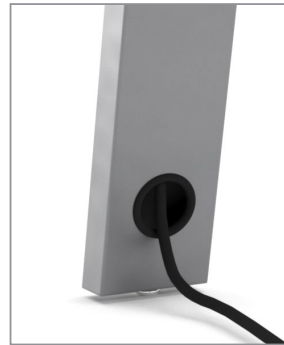
OPTIONAL POWER LEG GROMMET DETAIL