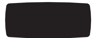
ALMOST RECTANGLE TOP CODE: CAT