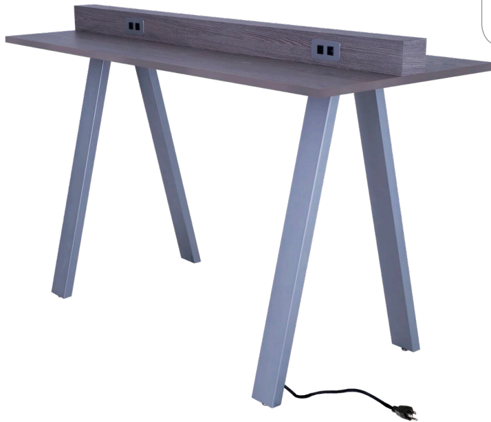
ASPEN BAR HEIGHT (42") TABLE WITH OPTIONAL CENTER POWER RISER, OPTIONAL COVE POWER OUTLETS (4) AND OPTIONAL POWER LEG GROMMET