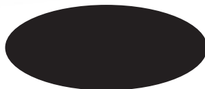
OVAL TOP CODE: COT