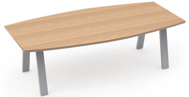
OPTIONAL BOAT TOP WITH METAL LEGS