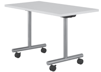
T-LEG FLIP-TOP TABLE WITH CASTERS