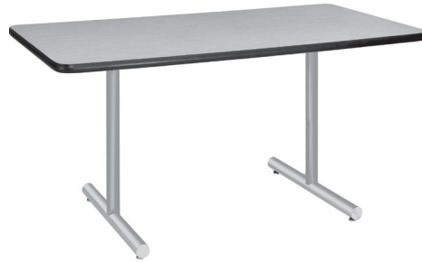
T-LEG TRAINING TABLE