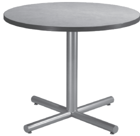
X-BASE CAFÉ TABLE

The Brandon Silver line offers the same quality as our Brandon tables at an even more affordable price point.