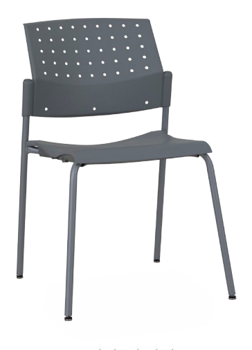
poly back chair

The Brio collection makes it easy. Designed for use in multi-purpose spaces that can be used for classrooms, conference rooms, training or meeting rooms. When you need to transform the room quickly, from one application to another, the Brio and ERG tables are the perfect fit.