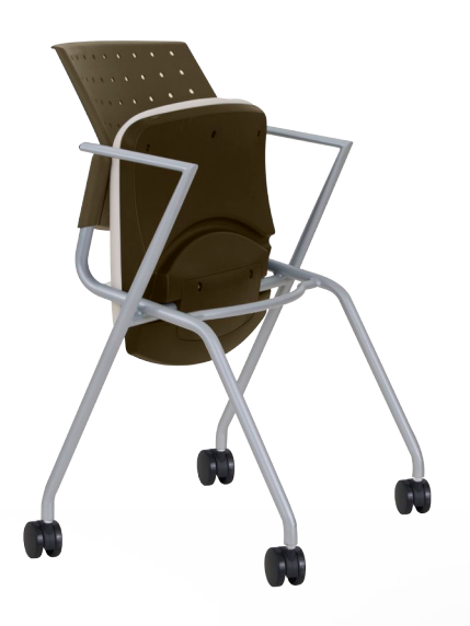
Brio flip / angle arm frame