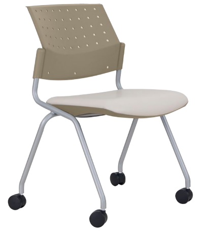
poly back flip with casters