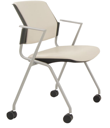
upholstered back insert on flip with arms and casters