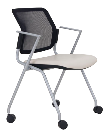
mesh back flip with arms and casters