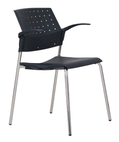
poly back chair with arms