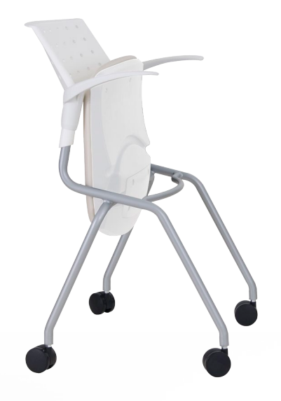
Brio flip / poly back and arms