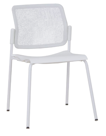
mesh back chair