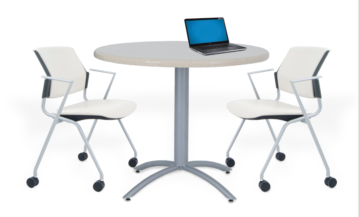
Brio will help you maximize your space!