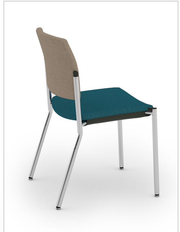
WALL SAVER FRAME