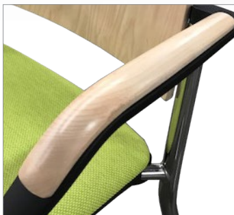
WOOD ARM CAP DETAIL