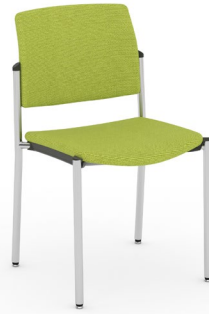
4 LEG CHAIR