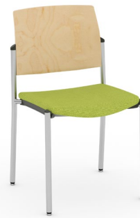
4 LEG CHAIR