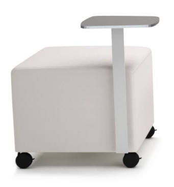
mobile tabouret with vertical tablet arm