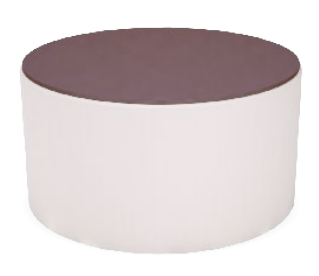
30" dia. upholstered