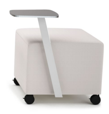
mobile tabouret with diagonal tablet arm