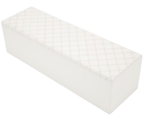
three seat bench with tufting