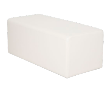
two seat bench