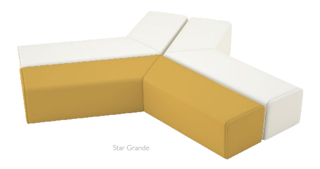
Star Grande accentuates any configuration and cluster seating both as a design centerpiece and functional seating