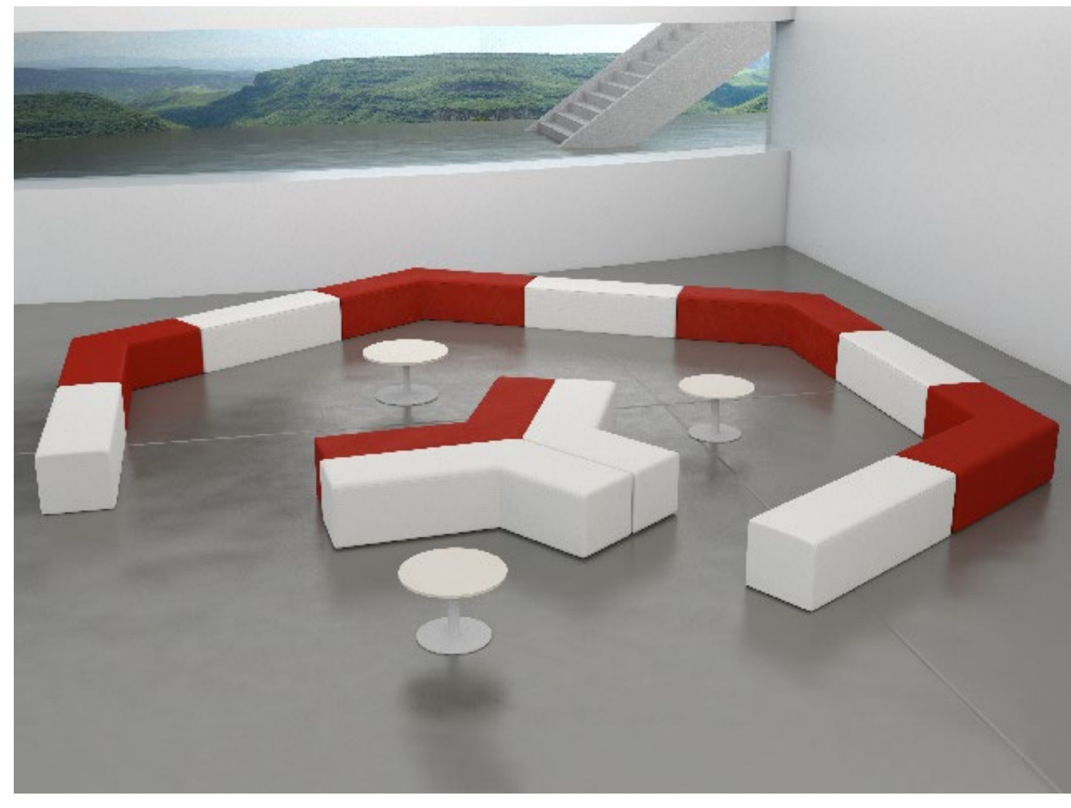
"Penta" includes 3 seat benches L-I and L-2 Angle Units, Star Grande configuration and complementary Corsa occasional tables