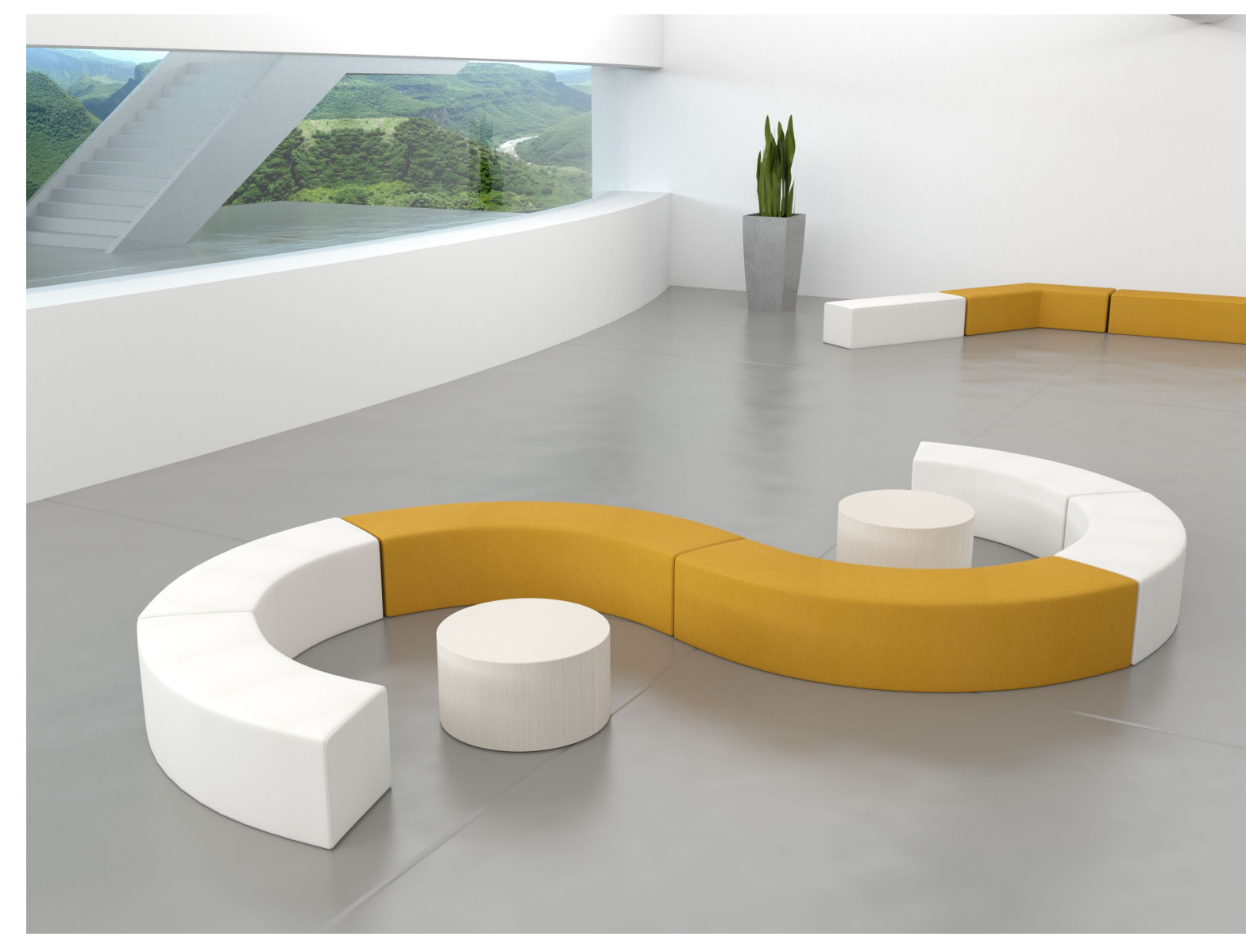
"S" configuration made up of Connos Arc units with 30" round tables, background: 2 seat bench, 3 seat bench and L-1 corner