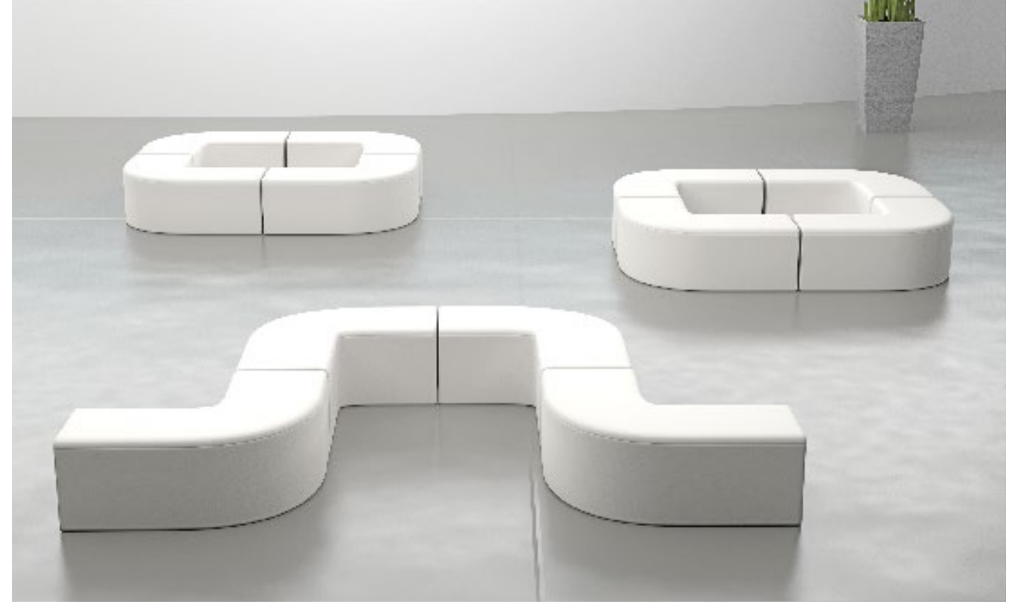
Cluster seating using 90° round corners