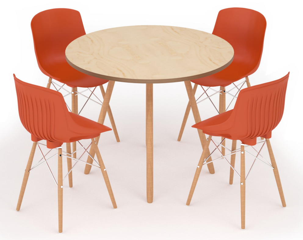
Elliot cafe table with wood leg chairs