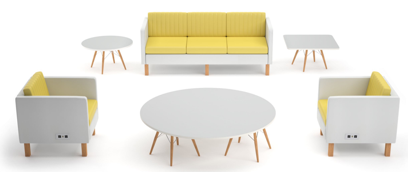
Elliot occasional tables with Franky Slim lounges