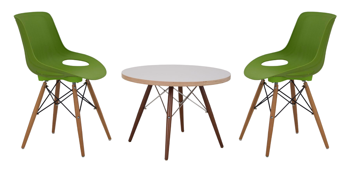
occasional table and café chairs