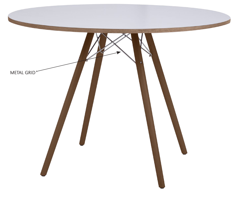
Wood Stain Leg Finish