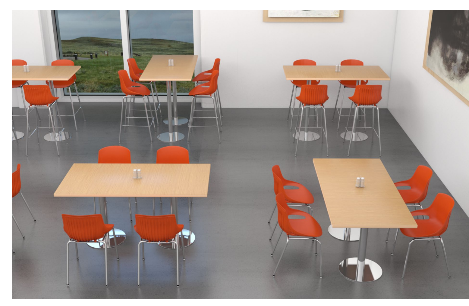
metal leg chairs and bar stools with Corsa cafe tables featuring polished chrome bases