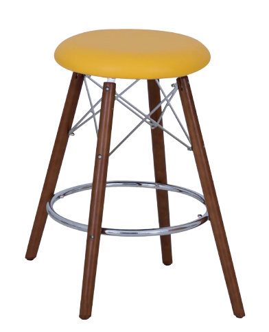
counter stool - 24" height