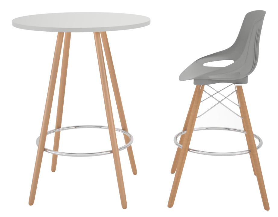
bar height cafe table and bar stool