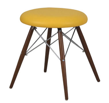
tabouret - 18" height