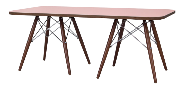
rectangle occasional table