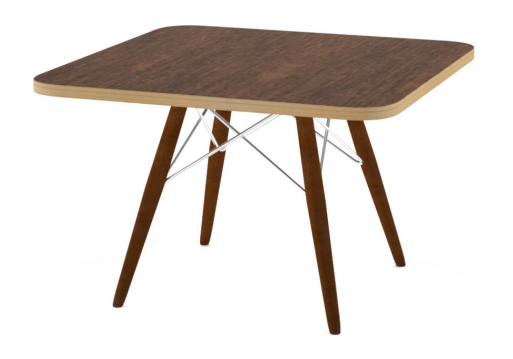
square occasional table