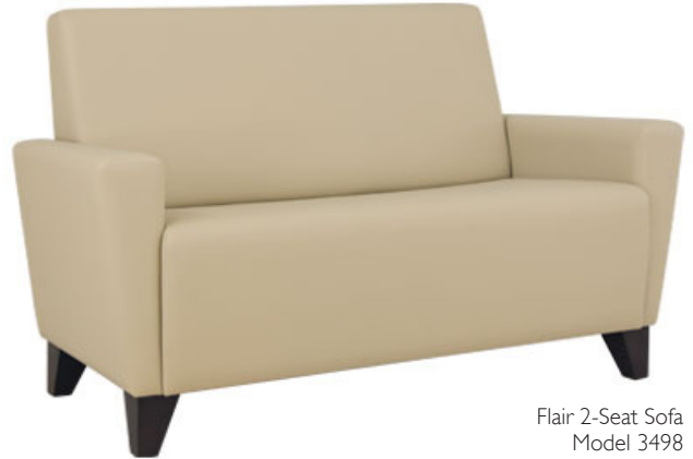
Flair 2-Seat Sofa Model 3498

End of Life: Recycling & Reuse ERG designs our products so that they can be easily disassembled and separated for recycling or reuse at the end of a products useful life.