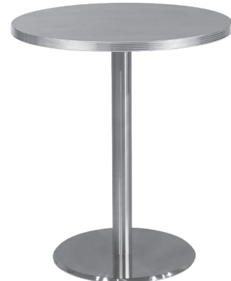
BAR HEIGHT POLISHED CHROME FINISH