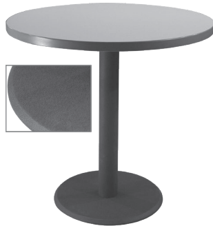
ROUND TOP BLACK TEXTURE FINISH

Flatcut Series has a round cast iron base with a steel cover. This series is an ERG special economically priced offering.