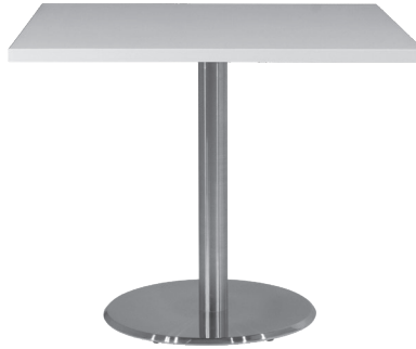
SQUARE TOP POLISHED CHROME FINISH