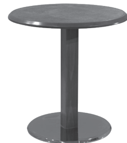
OPTIONAL SQUARE WOOD COLUMN