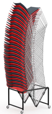
sled base chair stacks 45 on dolly