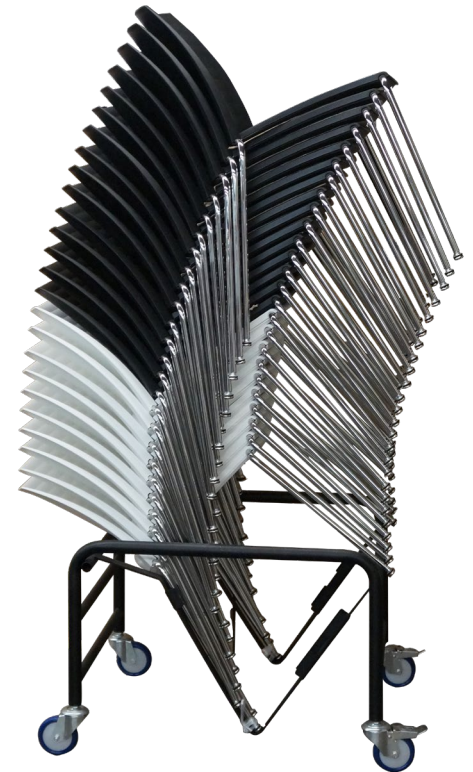
DOLLY STACKS UP TO 25 HIGH ON 4 LEGGED BASE