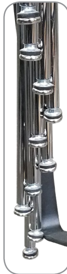
STEEL GLIDES INSTALLED ARE STANDARD