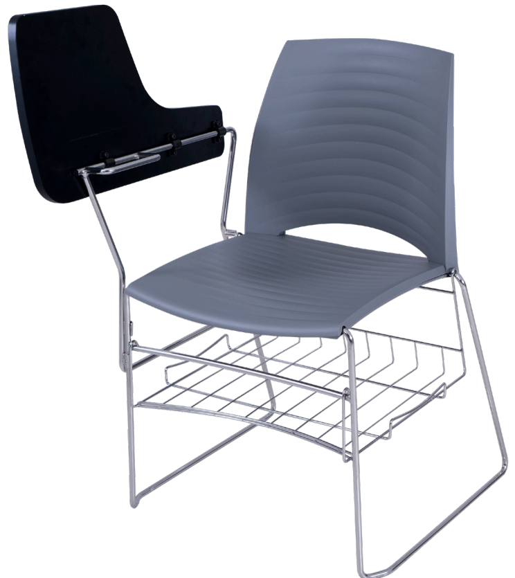
FOLDING TABLET ARMS WITH BASKET