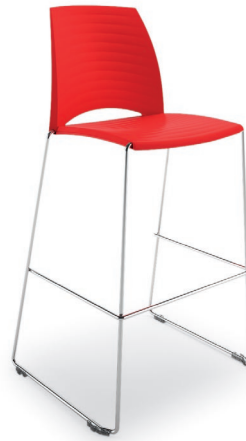
SLED BASE BAR STOOL WITH OPTIONAL CLEAR PLASTIC GLIDES