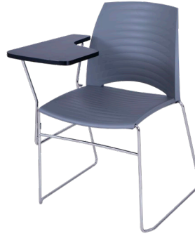
SLED BASE WITH TABLET ARM

FLIP-UP TABLET ARMS WITH ARMS SUPPORT ARE REMOVABLE