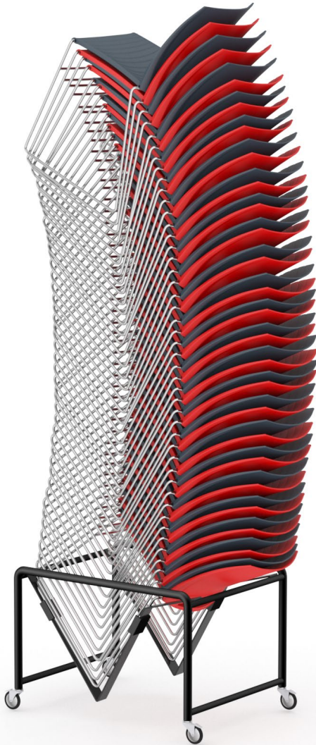
DOLLY STACKS UP TO 45 HIGH ON SLED BASE