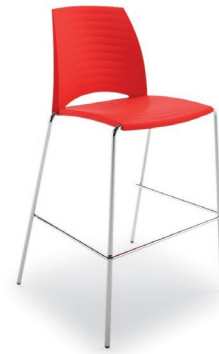
COUNTER HEIGHT W/OPTIONAL CLEAR PLASTIC GLIDES