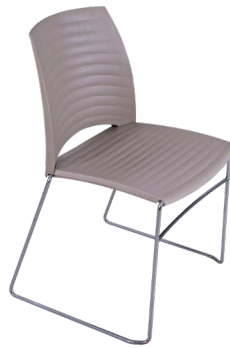
SLED BASE STACKS UP TO 45 HIGH ON DOLLY