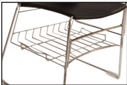
Optional Removable Basket