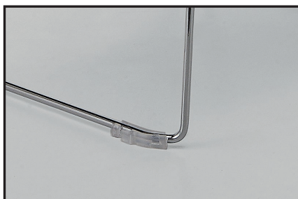
Optional Clear Plastic Glides