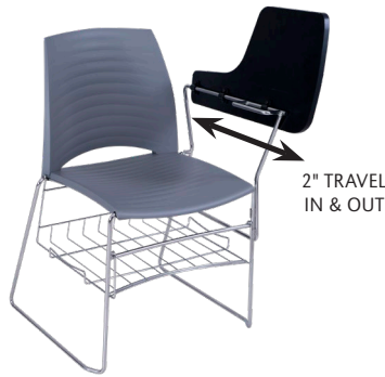
SLED BASE WITH TABLET ARM AND BASKET

TABLET ARM & BASKET SHIPPED SEPARATELY EASY TO INSTALL