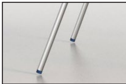
Optional Poly Glides