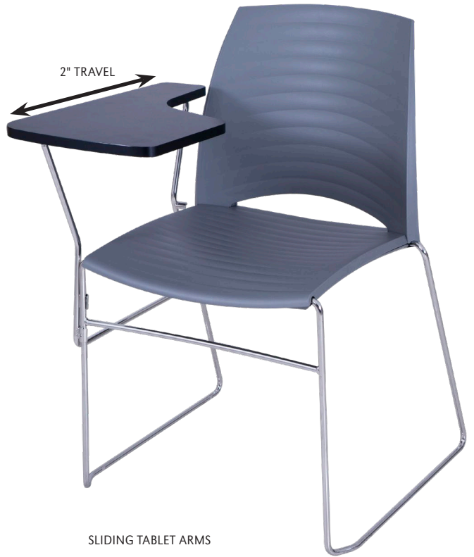
SLIDING TABLET ARMS