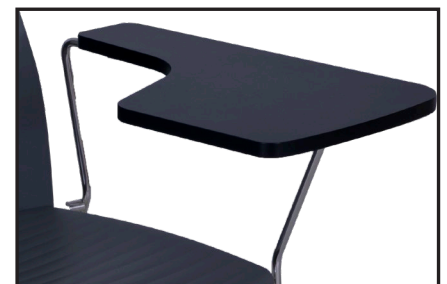
Optional Left Arm Support with Tablet