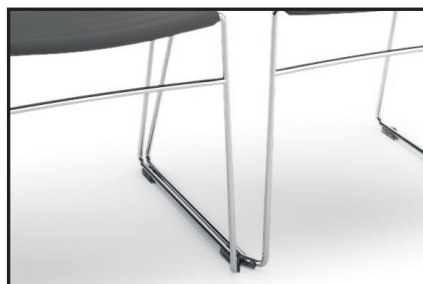
Optional Ganging Device Clear Plastic