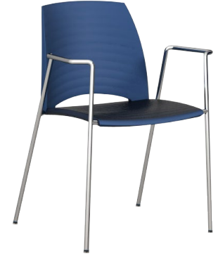
4-LEG CHAIR W/ARMS