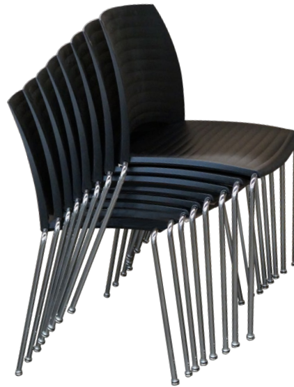
4 LEGGED BASE STACKS UP TO 8 HIGH ON FLOOR

NOTE: A STACK OF 25 4 LEG CHAIRS HAVE A HEIGHT OF 72" ON DOLLY