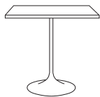
counter height table base dia. 18" or 24" h 36"