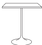
bar height table base dia. 18" or 24" h 42"