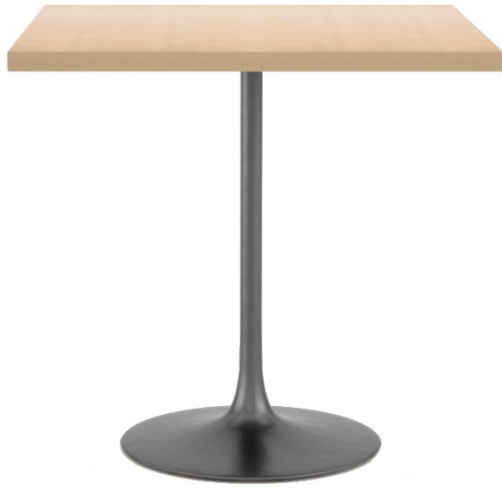
bar height table