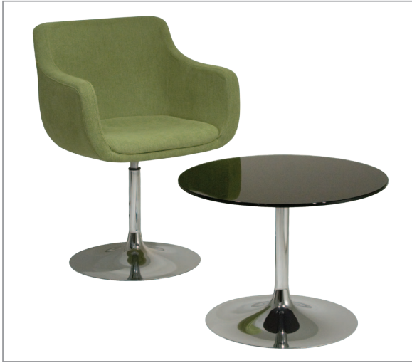
Harmony Black Glass Occasional Table with Dania Chair