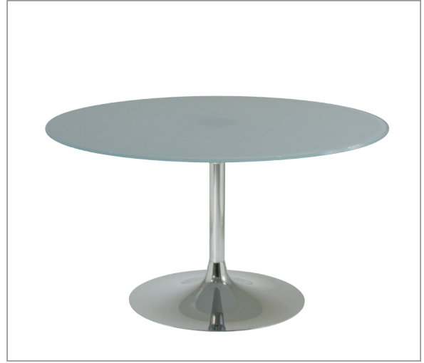
Harmony White Glass Coffee Table