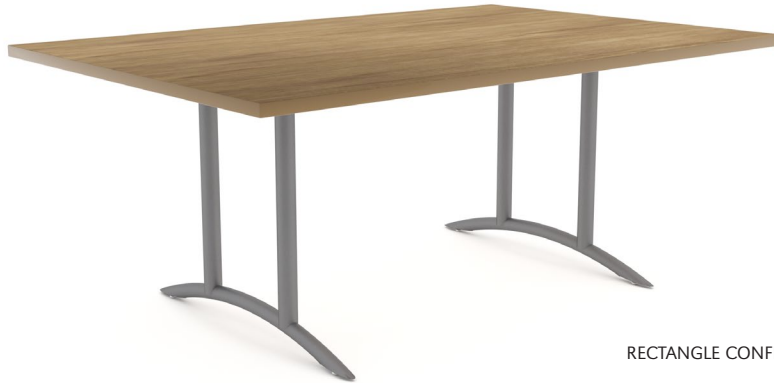
RECTANGLE CONFERENCE TABLE