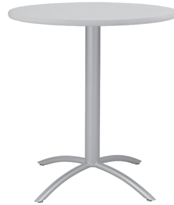
BAR HEIGHT TABLE