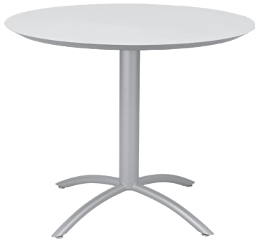
CAFÉ TABLE WITH KRYSTALCAST® TOP