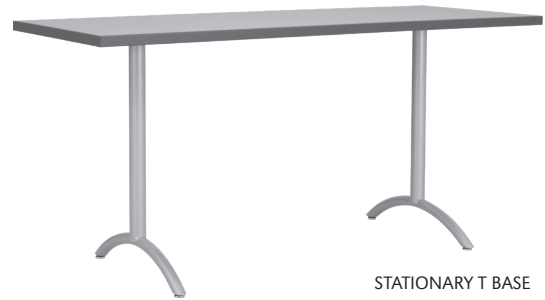
STATIONARY T BASE