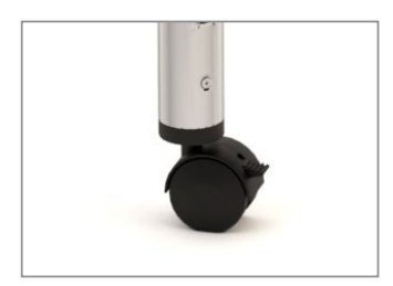
optional mobile locking casters