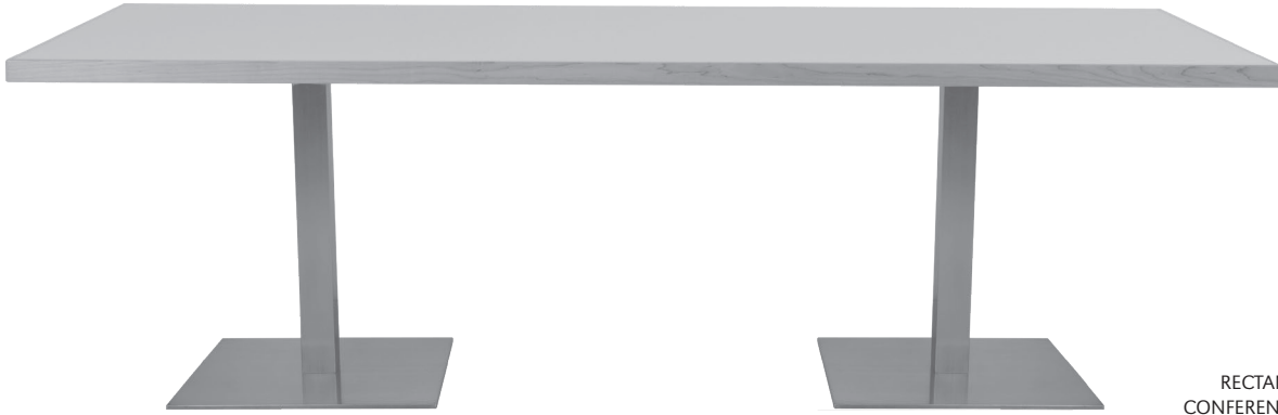
RECTANGLE CONFERENCE TABLE