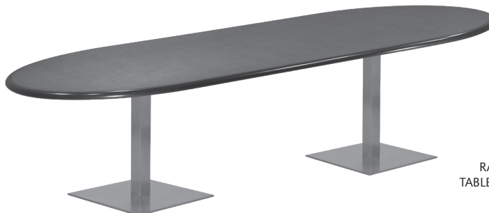
RACETRACK TABLE TOP OPTION