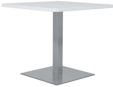
MONACO LAMINATE TOP