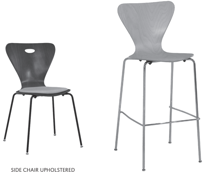
SIDE CHAIR UPHOLSTERED SEAT INSERT