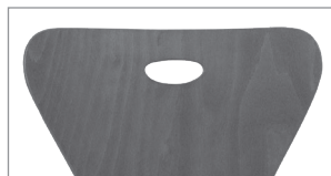
HAND GRIP CUTOUT