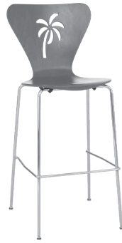
BAR STOOL WITH DBC OPTION