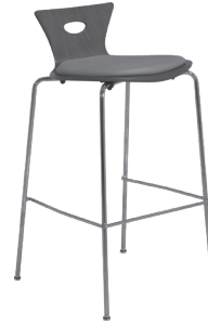
DEMI BACK BAR STOOL