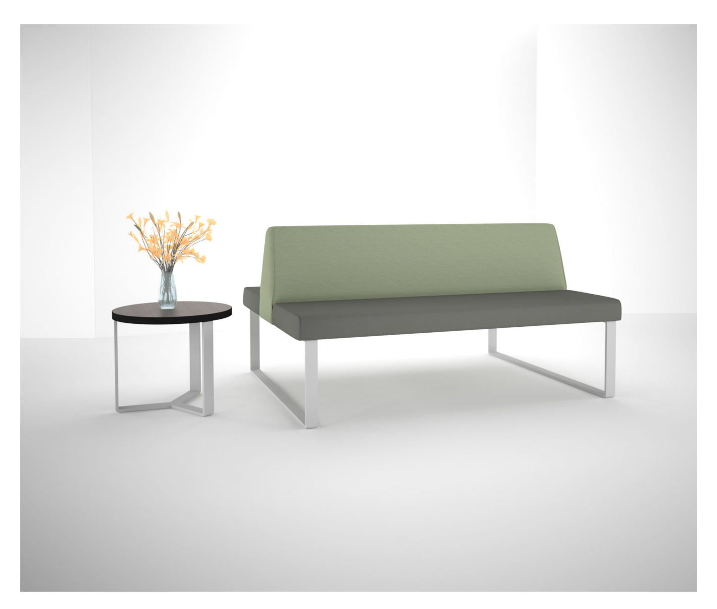
custom back-to-back and occasional table