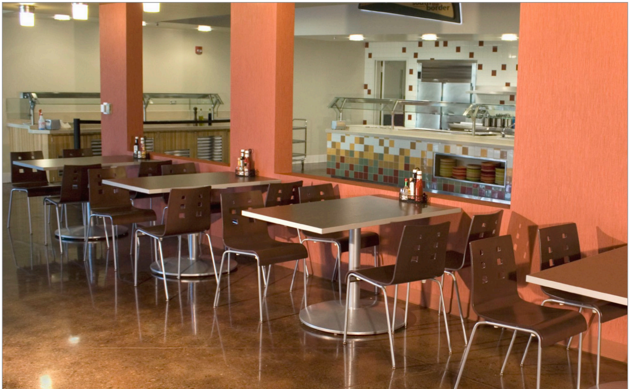
Pento side chairs with DOC option / Dome café tables