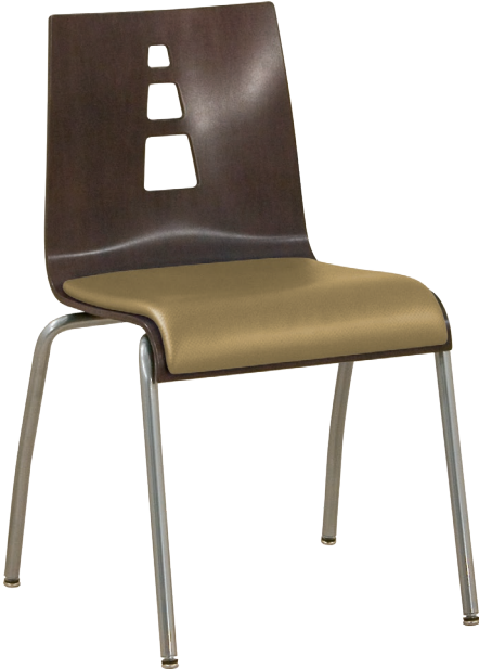
side chair / trapezoid cutout and upholstered seat options