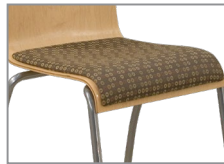
upholstered seat insert