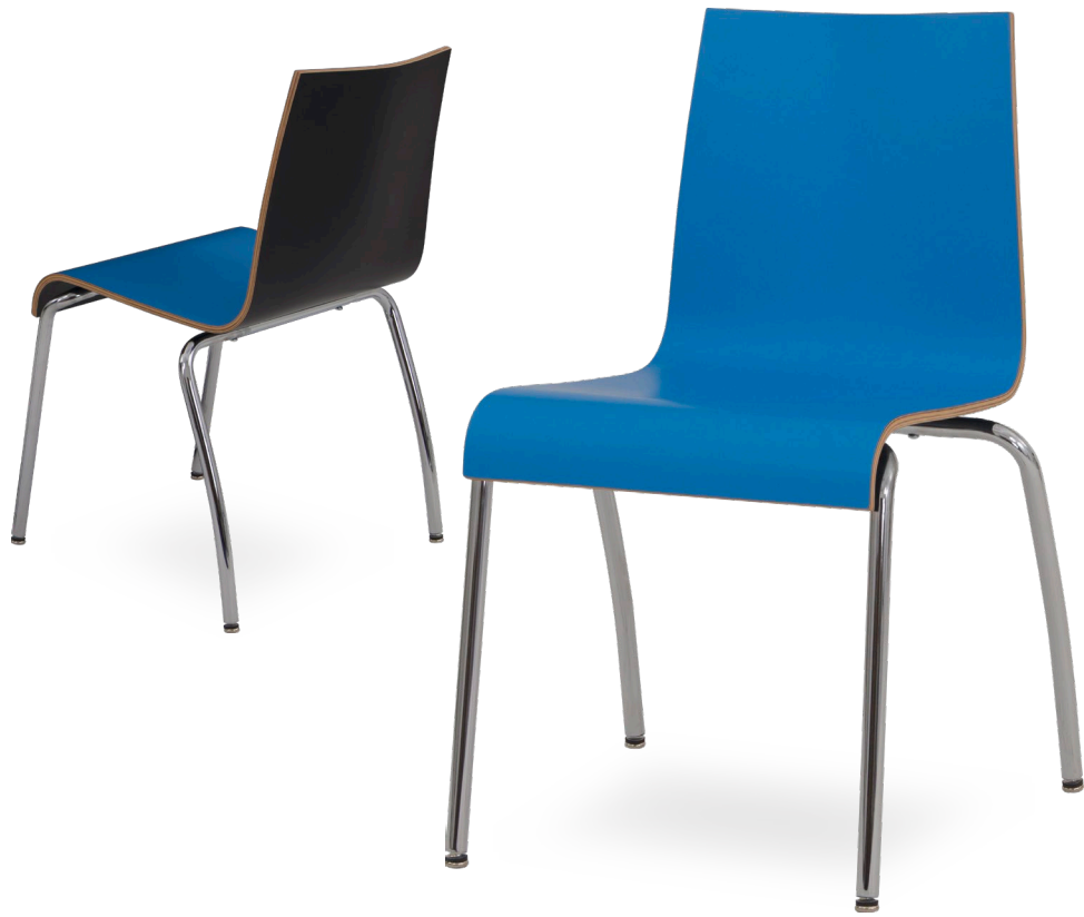
side chair / LPS dual laminate option