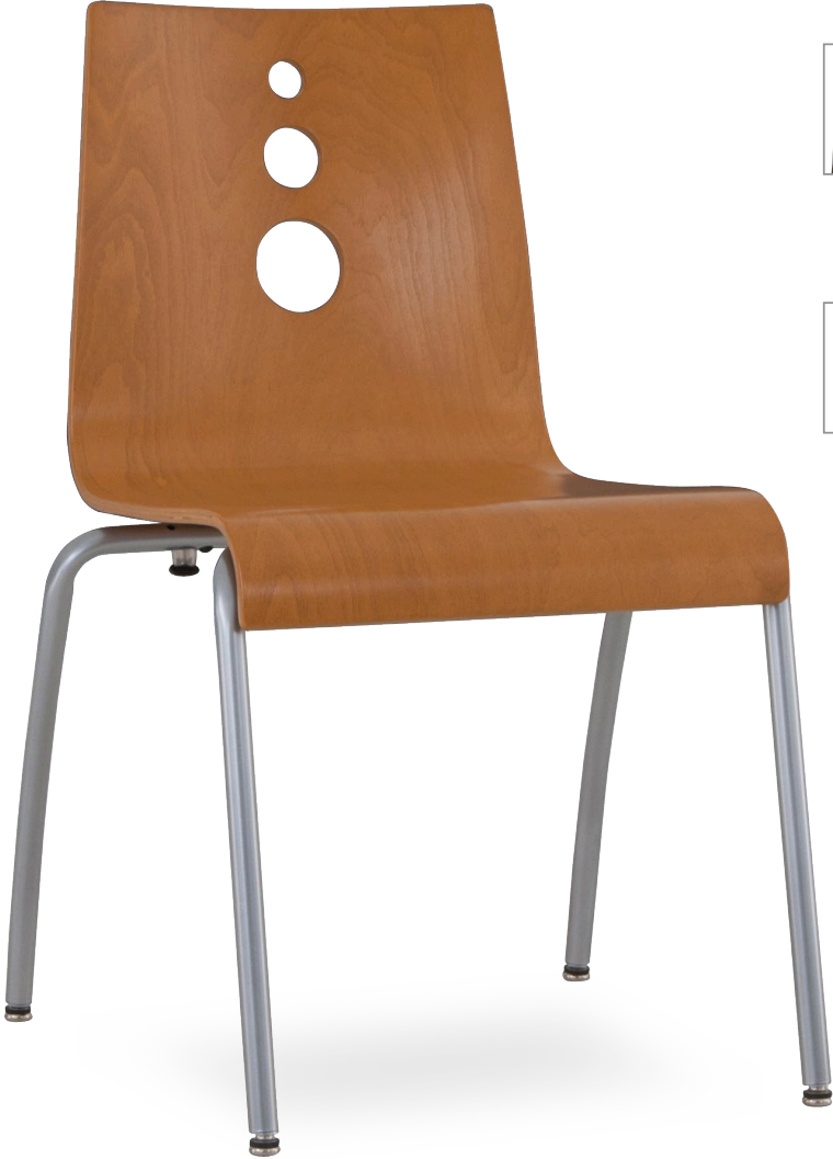
side chair / round cutout option