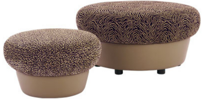
Puffet Full Round 4292, 36" Dia. Muffet Full Round 1353, 24" Dia.

End of Life: Recycling & Reuse ERG designs our products so that they can be easily disassembled and separated for recycling or reuse at the end of a products useful life.