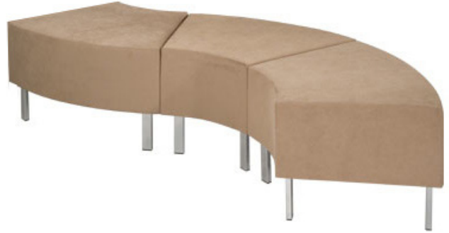
Rola Modular Bench 3 ea. Rola 800 1/8 Wedge w/806 Legs

End of Life: Recycling & Reuse ERG designs our products so that they can be easily disassembled and separated for recycling or reuse at the end of a products useful life.