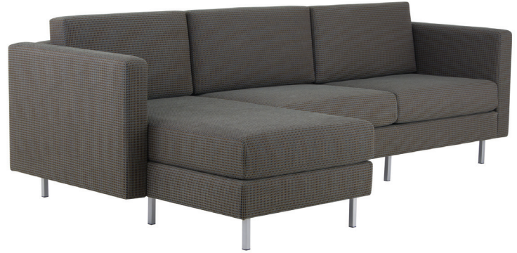
Sammy 3 Seat Lounge Sofa with Chaise, Model 6404

End of Life: Recycling & Reuse ERG designs our products so that they can be easily disassembled and separated for recycling or reuse at the end of a products useful life.