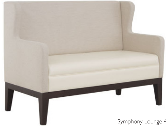
Symphony Lounge 4952 2-Seat Sofa

End of Life: Recycling & Reuse ERG designs our products so that they can be easily disassembled and separated for recycling or reuse at the end of a products useful life.