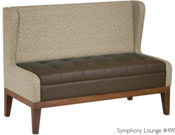
Symphony Lounge #4902 2-Seat Banquette

End of Life: Recycling & Reuse ERG designs our products so that they can be easily disassembled and separated for recycling or reuse at the end of a products useful life.