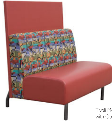
Tivoli Model 642, shown with Optional Privacy Panel

ERG designs our products so that they can be easily disassembled and separated for recycling or reuse at the end of a products useful life.