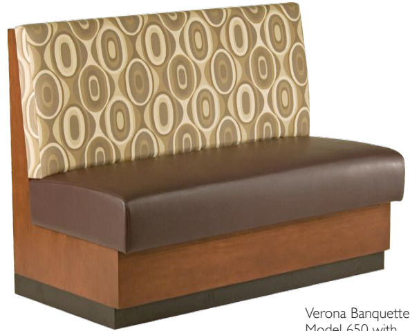
Verona Banquette Model 650 with Wood Veneer Frame

End of Life: Recycling & Reuse ERG designs our products so that they can be easily disassembled and separated for recycling or reuse at the end of a products useful life.