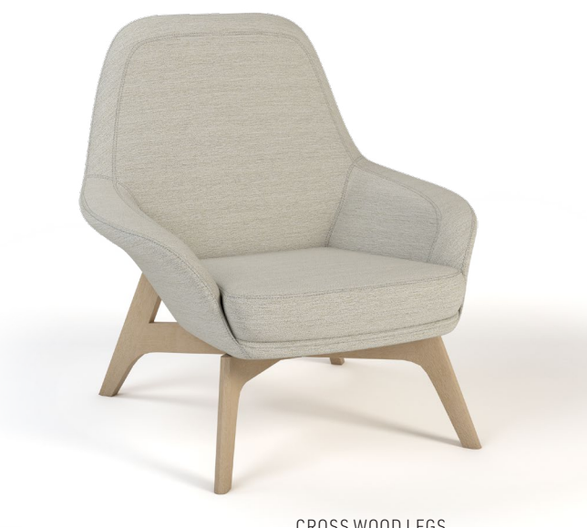
CROSS WOOD LEGS