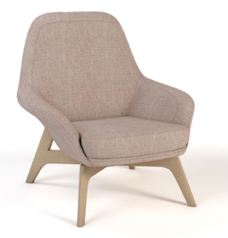
CROSS WOOD LEG CHAIR