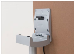
FLIP TOP FOR TWO T-LEGS

Note: When ordering modesty panel, table and panel must have 3MM edge.