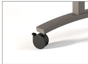
3" LOCKING CASTERS