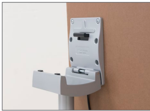
FLIP TOP FOR TWO T-LEGS

Note: When ordering modesty panel, table and panel must have 3MM edge.