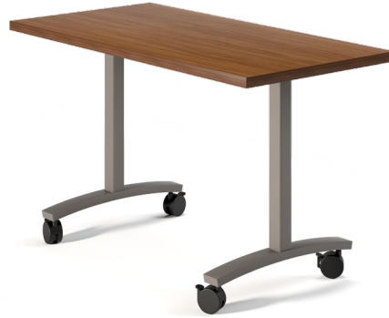
TRAINING TABLE SHOWN WITH OPTIONAL CASTERS