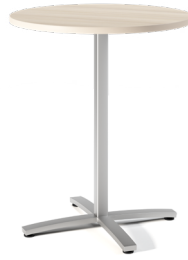
ROUND CAFÉ BAR HEIGHT TABLE