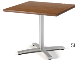
SQUARE CAFÉ TABLE