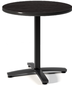
ROUND CAFÉ TABLE

Archer tables combine the best of form and function into one of our most durable and stylish models. Archer is perfect for a variety of applications from training to public spaces and dining. The fully welded arched base design is available in all of our standard powder coat finishes and makes integrating technology a breeze.