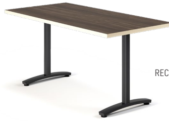
RECTANGLE TRAINING TABLE