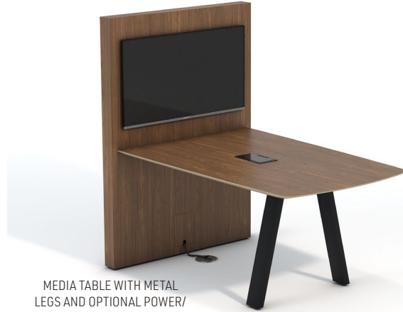
MEDIA TABLE WITH METAL LEGS AND OPTIONAL POWER/DATA AND ALMOST RECTANGLE TOP