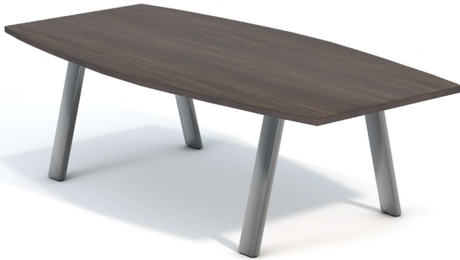
ASPEN CONFERENCE TABLE WITH BOAT RECTANGLE TOP

The Aspen tables offer a dynamic style for conferencing and meeting areas. It offers conference tables, as well as a bar height table with a power bar and a media wall table, great for a touchdown meeting. The sharp and substantial angled leg creates a dynamic look offered in both metal or wood legs, that convey a bold and stylish look with a solid foundation.