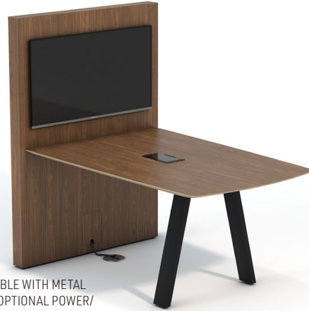
MEDIA TABLE WITH METAL LEGS AND OPTIONAL POWER/DATA AND ALMOST RECTANGLE TOP