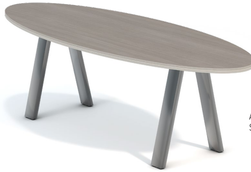
ASPEN CONFERENCE TABLE SHOWN WITH OVAL TOP