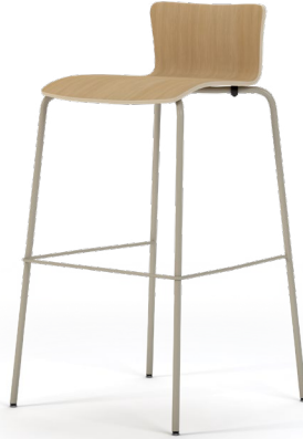
DEMI BACK BAR STOOL