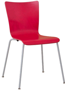
SOLID BACK CHAIR

Benton chairs feature a one piece wood shell. Steel frames are available in polished chrome in café & stool heights. Benton Shells are available in LPS, laminate covered shell (minimum order required).