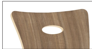
BUBBLE HAND GRIP CUTOUT

NOTE: LPS edge is only available in ERG Natural Maple