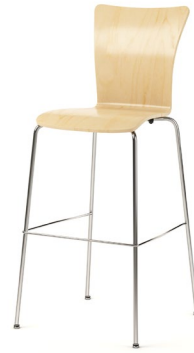
FULL BACK BAR STOOL