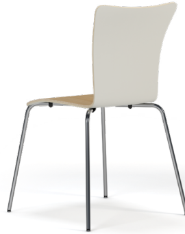
BENTON CHAIR WITH LPS OPTION