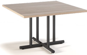
CAFÉ TABLE SHOWN WITH 4-COLUMN BASE