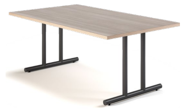
CONFERENCE TABLE SHOWN WITH TT-BASE