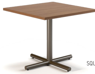
SQUARE CAFÉ TABLE