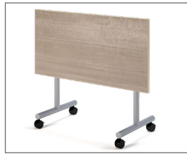
FLIP TOP FOR TWO T-LEGS