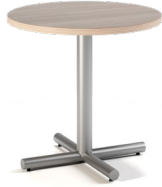
ROUND CAFÉ TABLE

The Brandon collection is a classic column style that offers a comprehensive line of café, training and conference tables. It is accompanied with a trapezoid and half round shape, to construct larger tables with our typical shapes, while allowing for adaptability to move them apart into smaller worktables. This look is a perfect fit for any dining space, learning space or meeting room with a variety of base options.