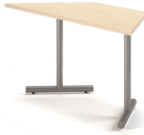
TRAPEZOID TRAINING TABLE SHOWN WITH T-BASE