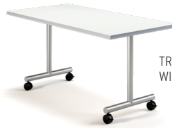
TRAINING TABLE SHOWN WITH OPTIONAL CASTERS