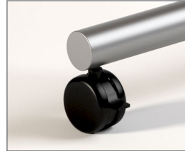
3" MOBILE CASTERS