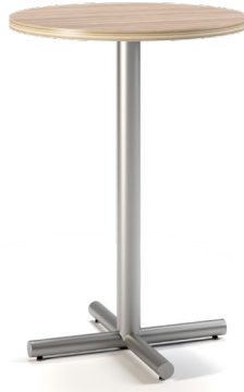
ROUND BAR HEIGHT TABLE