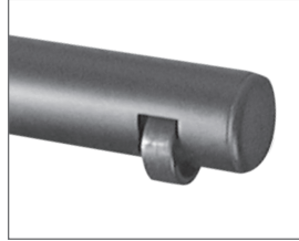
LOW PROFILE CASTERS