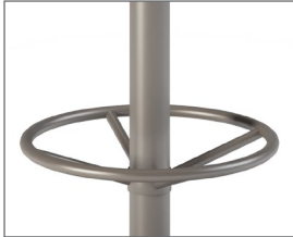
PAINTED FOOT RING FOR BAR HEIGHT