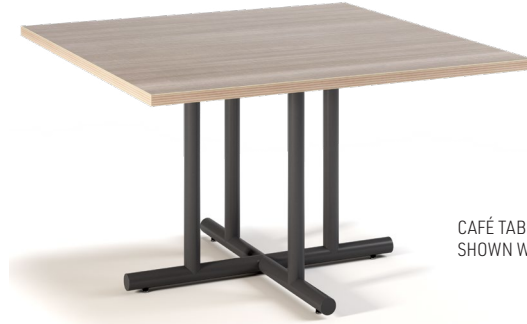
CAFÉ TABLE SHOWN WITH 4-COLUMN BASE