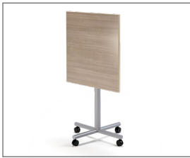
FLIP TOP WITH X-BASE ON CASTERS