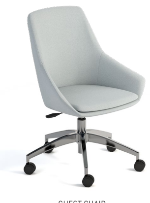
GUEST CHAIR 5-STAR SWIVEL WITH CASTERS