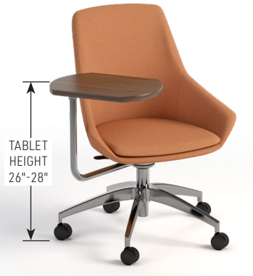
GUEST CHAIR 5-STAR SWIVEL CASTERS WITH A 360° TABLE PLUS A 360° ARM