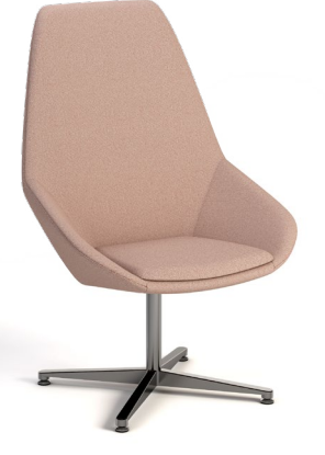
HIGH-BACK CHAIR 4-STAR BASE