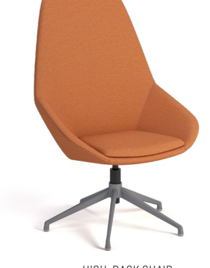
HIGH-BACK CHAIR HIGH FIVE GLIDE SWIVEL BASE