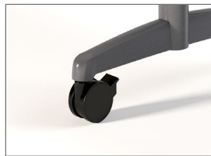
3" MOBILE CASTERS