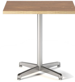
CAFÉ TABLE SQUARE SHOWN WITH X-BASE