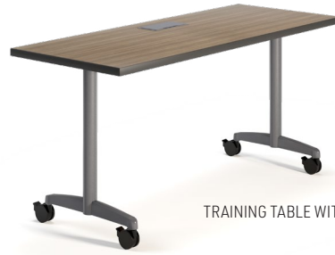
TRAINING TABLE WITH CASTERS