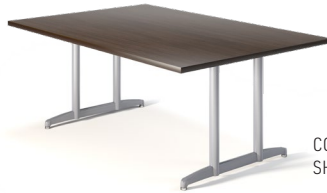
CONFERENCE TABLE RECTANGLE SHOWN WITH TT-BASE