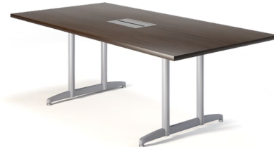
CONFERENCE TABLE SHOWN WITH TT-BASE