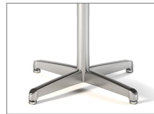
OPTIONAL POLISHED CHROME