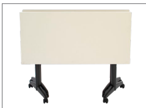
CROSSFIRE INLINE NESTING