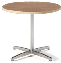
ROUND CAFÉ TABLE

The Crossfire table collection features a variety of base styles including the X-base, Y-base and T-leg bases. These versatile tables are perfect for dining, conference, and training areas, to the function of any space.