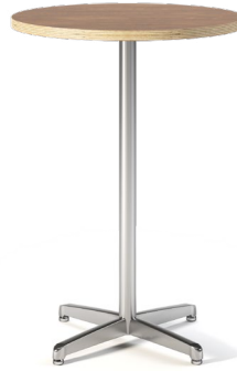
BAR HEIGHT TABLE ROUND SHOWN WITH X-BASE