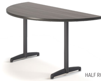
HALF ROUND TRAINING TABLE