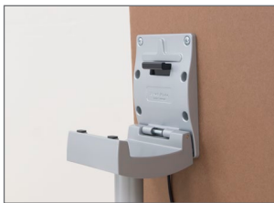
FLIP TOP FOR TWO T-LEGS

Note: When ordering modesty panel, table and panel must have 3MM edge.