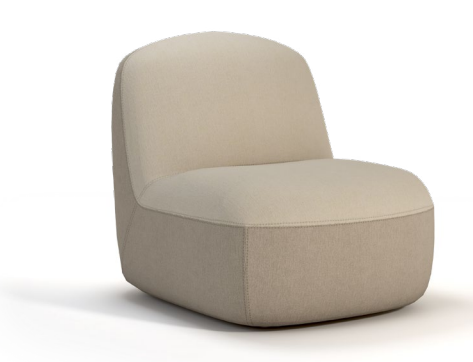
LOUNGE SEAT SHOWN WITH 2FO FABRIC