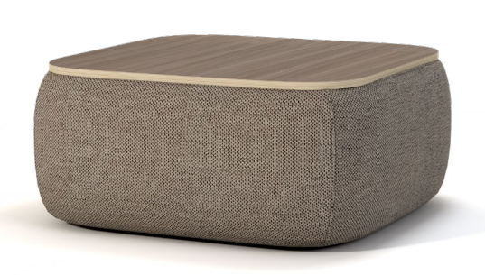
SINGLE LOUNGE OTTOMAN OTTOMAN W/LAMINATE TOP