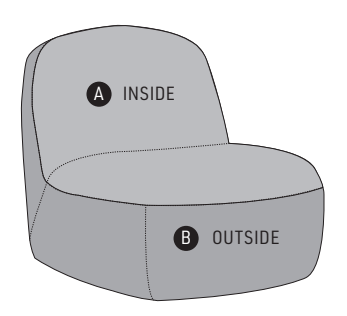
2 FABRIC OPTION

\ensuremath{\mathsf{NOTE}}\xspace : Due to the curves of this chair, it may cause wrinkling in the upholstery.