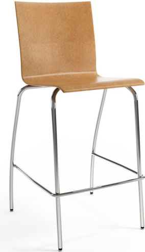
4-LEG TALL BACK STOOL