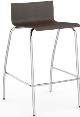
4-LEG DEMI BACK STOOL