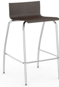
4-LEG DEMI BACK STOOL