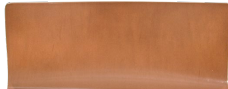
SOLID BACK (STANDARD)