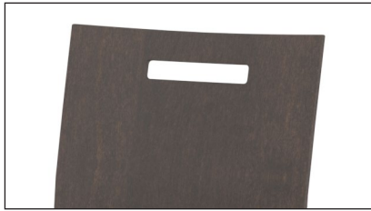
HAND GRIP CUTOUT