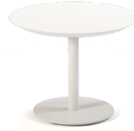
OCCASIONAL TABLE WITH ROUND TOP AND BASE