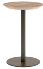
PULL UP TABLE WITH ROUND TOP AND BASE, SHOWN WITH KNIFE EDGE

Dixon has four tabletop shapes along with round base shape, and offered in varied heights to accommodate any design with purpose. Whether it is a personal pull up table or a coffee table, it looks great in any simple lounge area needing that extra support.