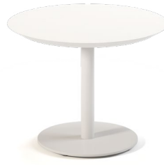
ROUND TOP AND BASE SHOWN WITH 6J KNIFE EDGE W/POLAR STAIN