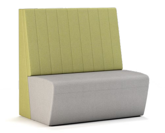
48" WIDTH BY 44" HEIGHT BANQUETTE