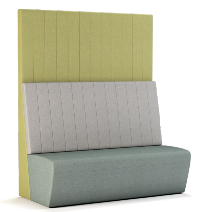
72"H PANEL SHOWN WITH OPTIONAL PANEL CHANNEL TUFTING AND THREE FABRICS.