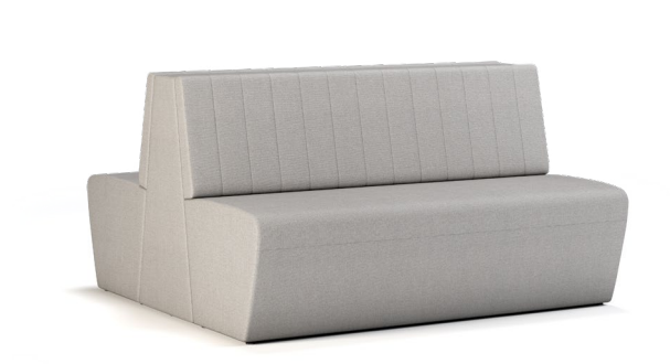
34"H LOW BACK-TO-BACK BANQUETTE

The Encino collection of banquettes offers an extensive variety of back heights with a unique channel detail look on the back and equipped to fit the right level of privacy needed for any space. The banquettes come as a single unit, as well as back-to-back, in a choice of glides or a plinth base. Great for any student union, cafeteria, corporate lounge or environment for comfortability.