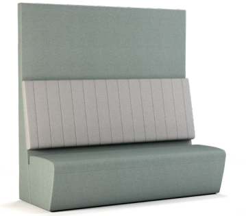
72" WIDTH BY 72" HEIGHT BANQUETTE