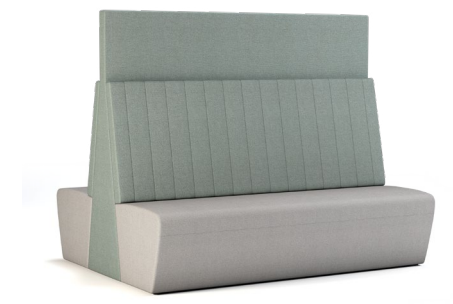
72" WIDTH BY 60" HEIGHT BACK-TO-BACK BANQUETTE