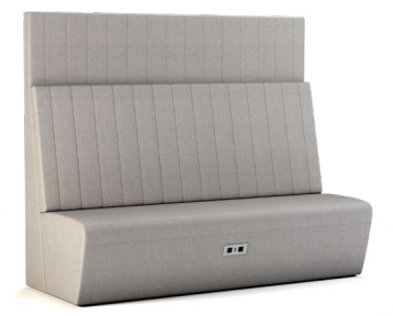
72" WIDTH BY 60" HEIGHT BANQUETTE