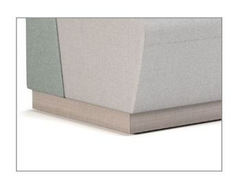
BANQUETTE COMES WITH A FLUSH PLINTH BASE ON SIDES FOR GANGING, AND RECESSED FRONT.