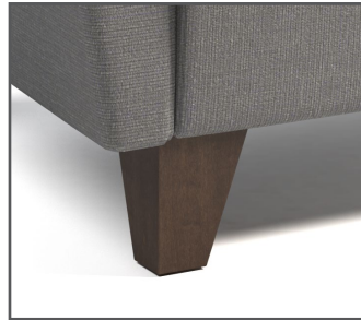
MAPLE WOOD LEGS