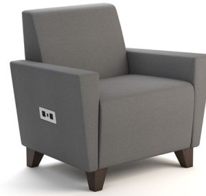
FLAIR SINGLE SEAT LOUNGE