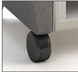
4" LOCKING CASTERS - BLACK