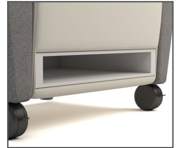
LAMINATED STORAGE SHELF