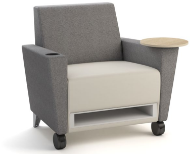
FLAIR SINGLE SEAT LOUNGE WITH TABLET ARM, STORAGE SHELF, CUP HOLDER AND OPTIONAL CASTERS

The Flair lounge is comprised of one, two and three-seat lounges with a wide arm at the top, that tapers down, giving it a nice flair in design. The myriad of options includes cupholders, back hand-grip, removeable tablet, casters and a laminated storage shelf. With all it has to offer, these lounges are substantial and work well in collaborative and common spaces.