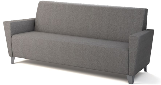
FLAIR THREE SEAT LOUNGE WITH POLISHED CHROME LEGS