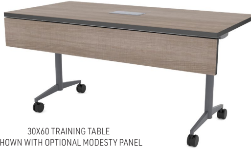
30X60 TRAINING TABLE SHOWN WITH OPTIONAL MODESTY PANEL