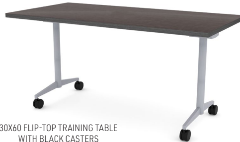
30X60 FLIP-TOP TRAINING TABLE WITH BLACK CASTERS

The Flight collection of training tables offers nesting, flip-to mech and locking casters. With its simple design and performance in mind, this high-tech look is a perfect fit for any mobile training space.