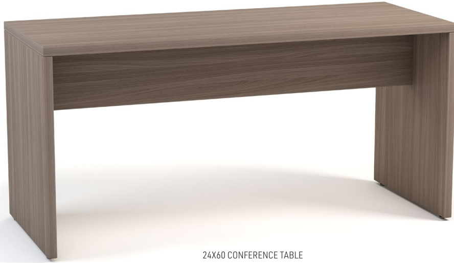
24X60 CONFERENCE TABLE

The Hetfield tables offer a panel leg look with a modesty panel and options of two or three contrasting laminates. Hetfield looks great as a huddle table for a touchdown space or a quick meet-up or training session. The full laminate panel has a sleek look ganged together to create the ultimate surface for learning or collaborating.