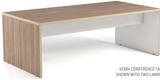
42X84 CONFERENCE TABLE SHOWN WITH TWO LAMINATES