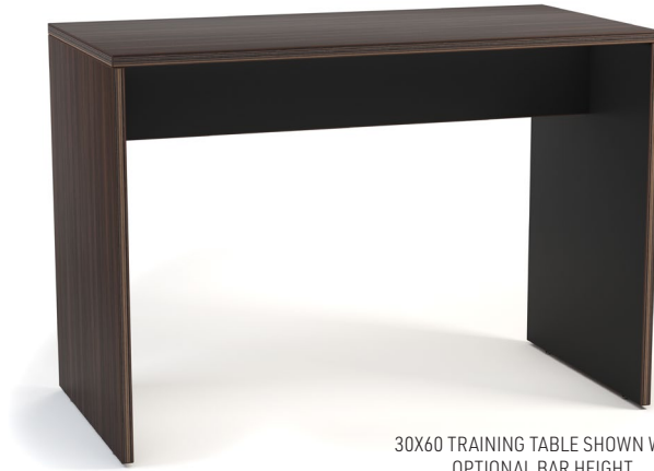
30X60 TRAINING TABLE SHOWN WITH OPTIONAL BAR HEIGHT