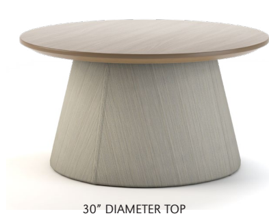
30" DIAMETER TOP