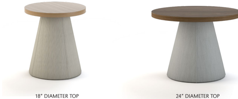
18" DIAMETER TOP