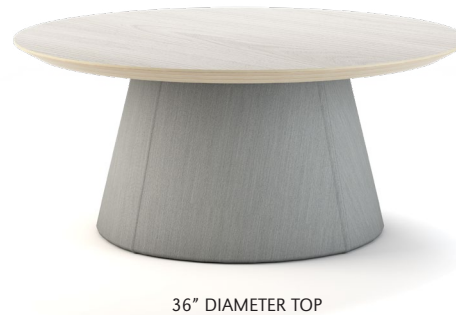
36" DIAMETER TOP