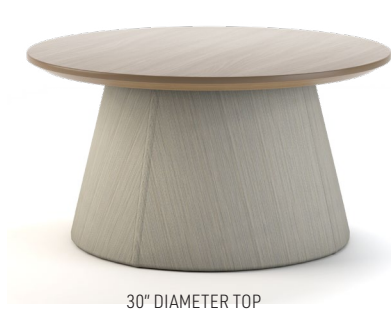
30" DIAMETER TOP