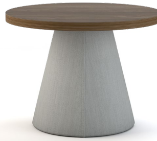
24" DIAMETER TOP