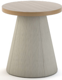
18" DIAMETER TOP