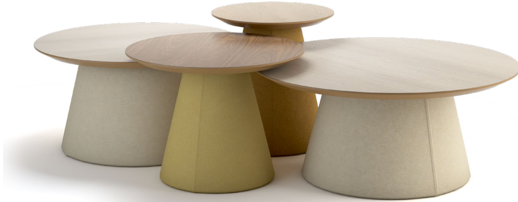
NESTING TABLES SHOWN WITH THE 6J EDGE

Indio tables are designed for the life of your collaboration. With a wide selection of sizes and heights, Indio will help you create the perfect space. The upholstered base is available in 4 sizes, that can show into nesting tables or stand alone. These tables have a base upholstered with a contemporary tapered design, to give them a modern and more comfortable feel.