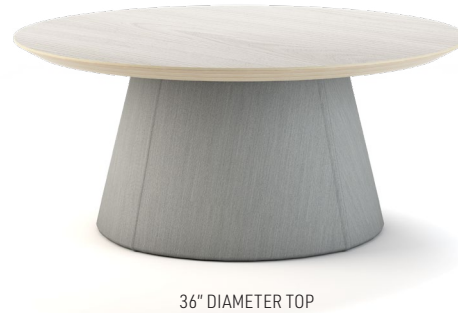
36" DIAMETER TOP