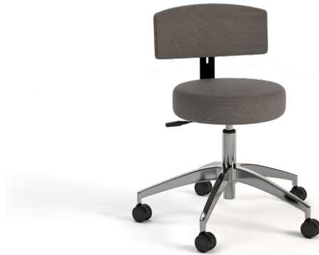
OPTIONAL 5-STAR SWIVEL WITH CASTERS, SHOWN WITH DEMI-BACK

The Libra Stool is available in three versions: upholstered swivel stool and upholstered stool. A great product for any medical exam room. Libra stools offer three five-star base designs with casters and pneumatic height adjustment.