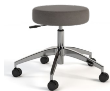
OPTIONAL 5-STAR SWIVEL WITH CASTERS