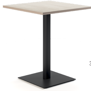
36" SQUARE BAR HEIGHT TABLE