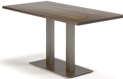
36X48 CAFÉ TABLE SHOWN WITH DOUBLE COLUMN BASE