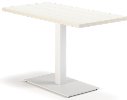
24X48" SINGLE COLUMN TABLE