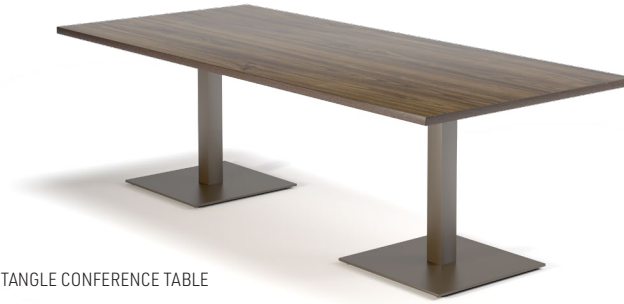
42X96" RECTANGLE CONFERENCE TABLE