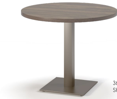
36" ROUND CAFÉ TABLE SHOWN WITH OPTIONAL POWDER COAT FINISH