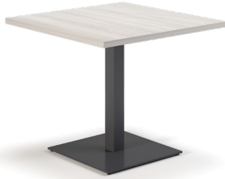
36" SQUARE CAFÉ TABLE SHOWN WITH OPTIONAL POWDER COAT FINISH

Experience the perfect blend of sophistication and functionality with the Monaco Table Collection! Designed to make a bold statement, Monaco tables feature a sleek stainless steel column paired with striking square and rectangular bases, exuding modern elegance. Whether you're energizing a bustling café or elevating a professional conference space, Monaco tables offer a refined aesthetic that seamlessly enhances any contemporary setting.